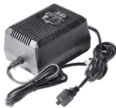
TEAC-66-243000V (EU) MKAC-66-243000U (USA) TEAC-66-243000VB (UK) Power adapter (for outdoor model)