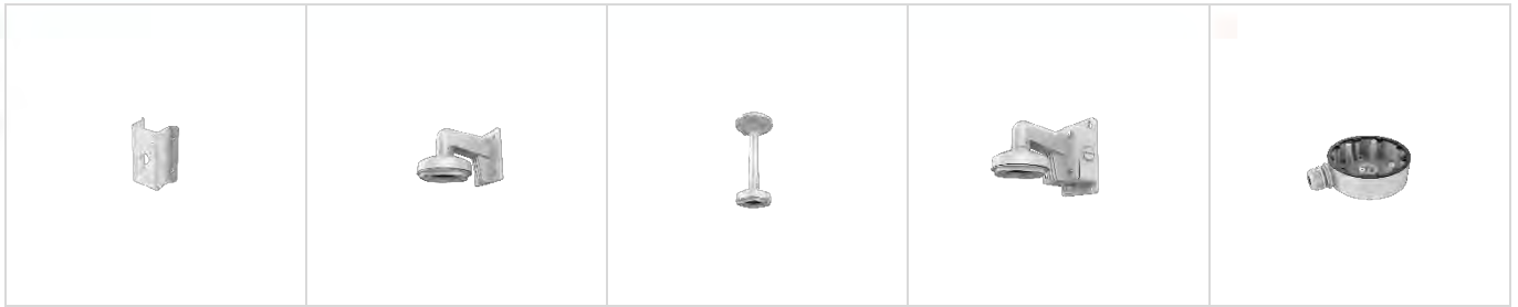
DS-1275ZJ-SUS Vertical Pole Mount