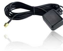
TIMENET Pro comes with antenna and 5 metre cable included